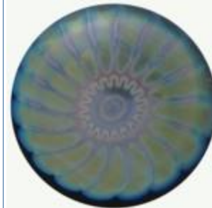
Style # 6

Available April 9th in 1 oz tins. Three different styles to choose from.