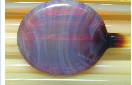
As well as Organic T-shirts!