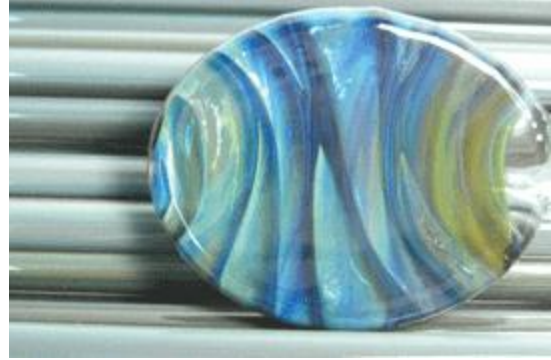
OK-428 based off of OK-326 and ST-382