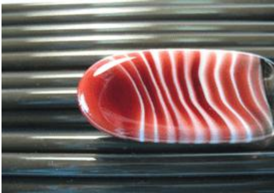
RA-399 a kiln striking ruby sample paddle is over white