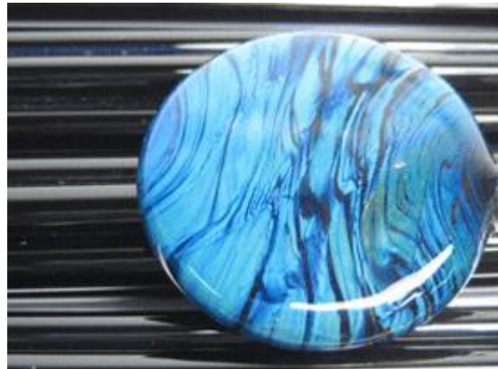
ES-405 another catalyst like ES-404 sample paddle is encased in Aion2.