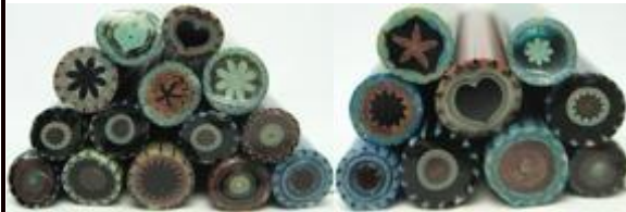
3-5 mm 5-7 mm

Actual styles will vary in each one ounce assorted tin.