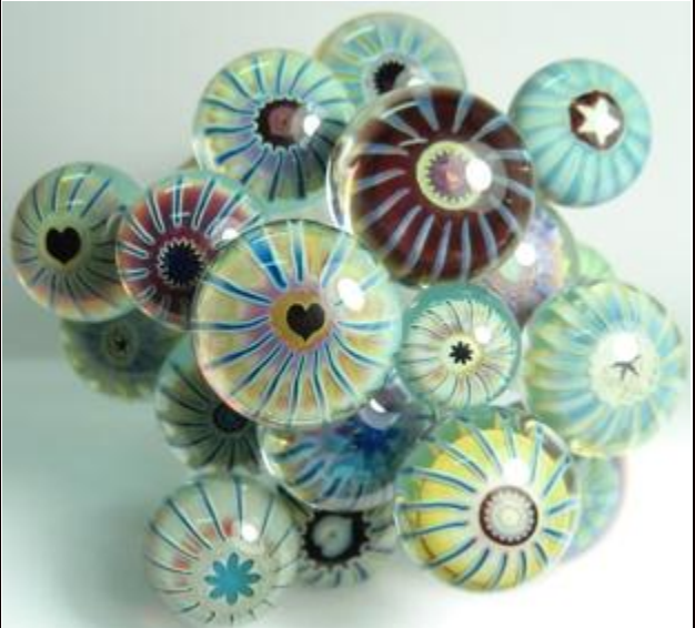
Photo above shows 5-7 mm murrini chips reduced, struck and encased in Aether.

Available in 3-5, 5-7 or 7-9 millimeters in diameter. All are cut to 50 mm in length. We tried out our new heart mold for this session! Each tin will contain one ounce of assorted murrini.